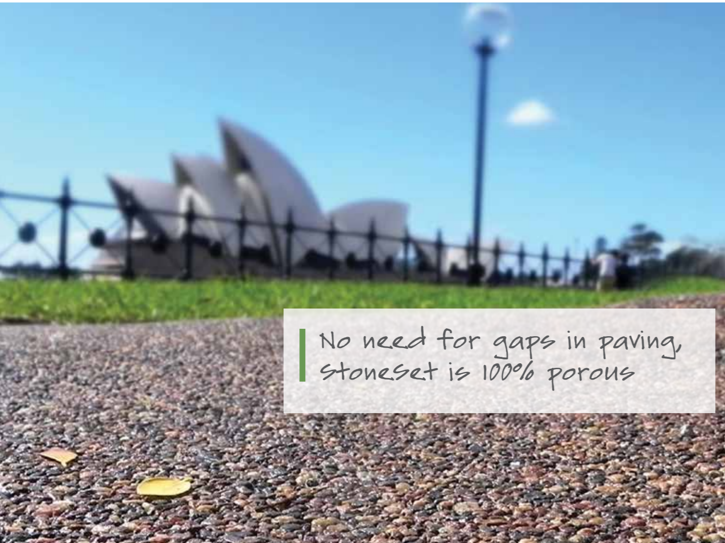
Tan StoneSet Tree surround

No need for gaps in paving, StoneSet is 100% porous