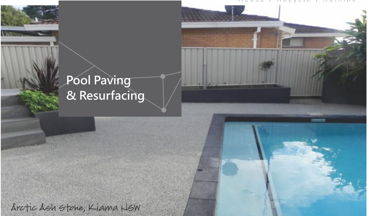
Arctic Ash Stone, Kiama NSW