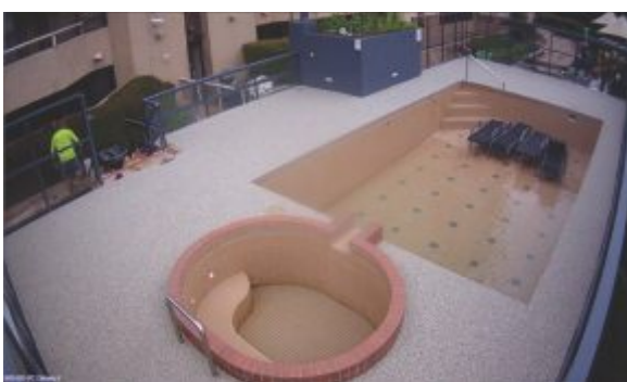
Fawceter Towers Rooftop, St Kilda VIC